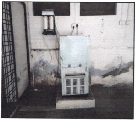
RO Water for Drinking Purpose