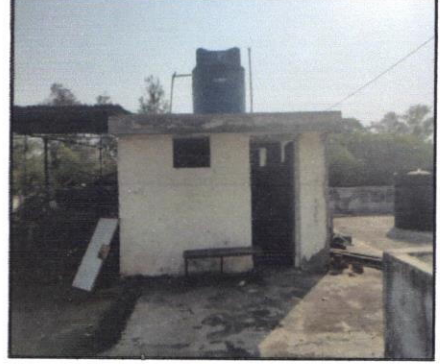
Roof Top Water distribution system