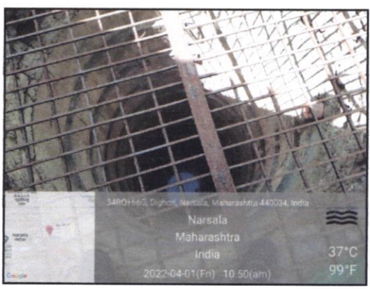
Wells situated in College Premises 2