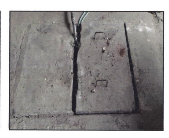
Wells situated in College Premises 1